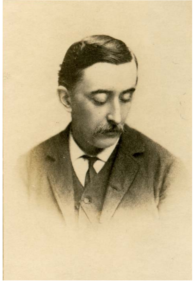
Lafcadio Hearn 1889, Philadelphia